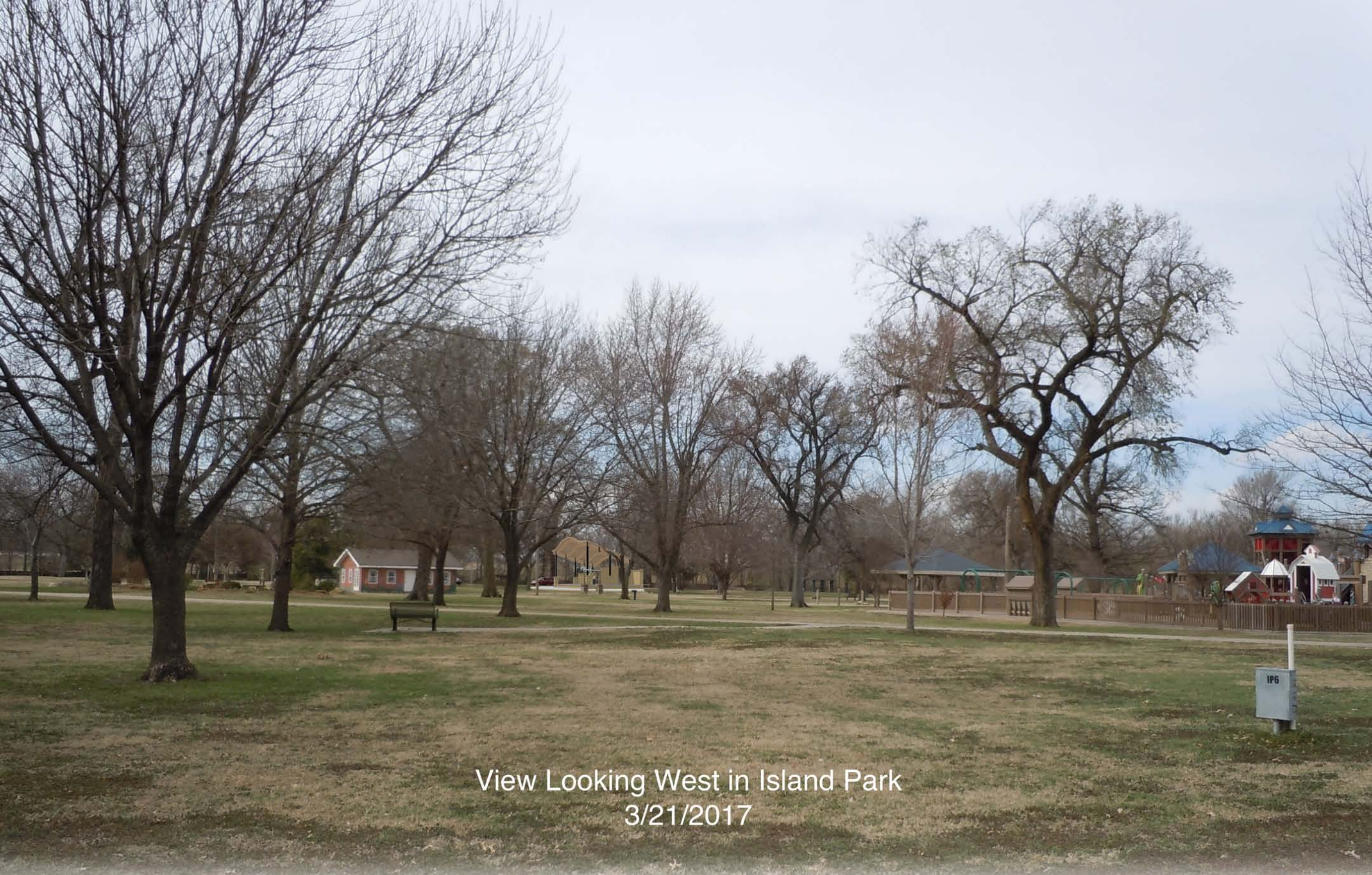
View Looking West in Island Park 3/21/2017

2018 Centennial Project Concept Rendering Winfield Rotary Club