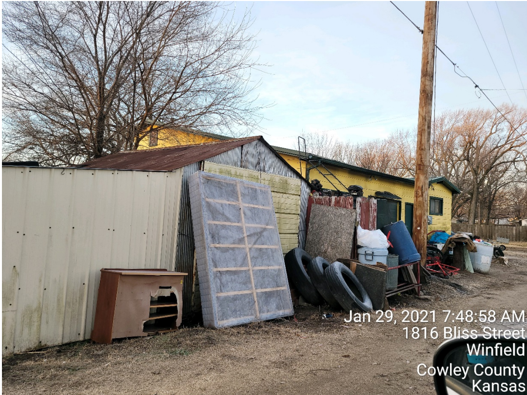
1816 Bliss #2-