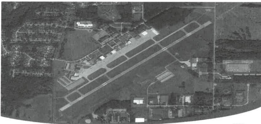
Cuyahoga County Airport