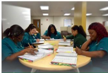
Medical Billing and Coding