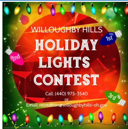
PHOTO CONTEST WINNERS

http://www.willoughbyhills-oh.gov/2020%20Holiday%20Lights%20Contest%20Entry%20FILLABLE.pdf