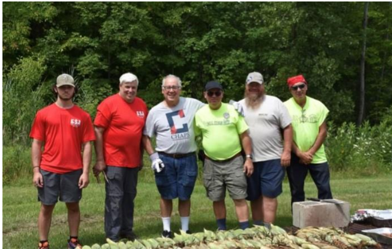
“The Corn Crew”