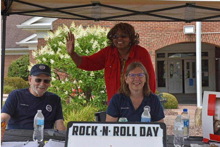
Council's "Welcome Booth"