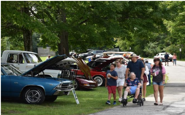
Classic Car Show