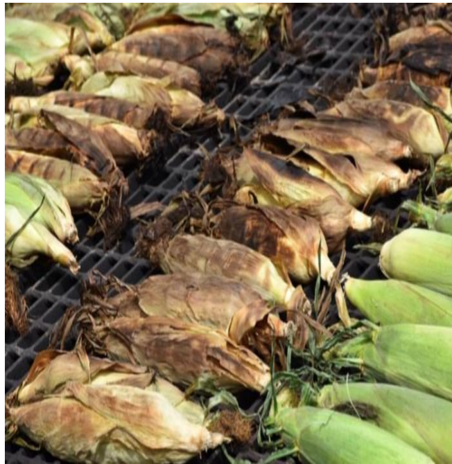
"Fresh Roasted Sweet Corn"