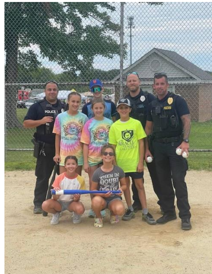
The kids beat the PD at wiffleball!