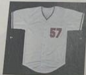
Signed Shane Bieber Jersey