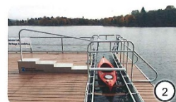
ACCESSIBLE KAYAK LAUNCH