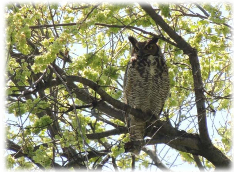
Northampton County Parks and Recreation