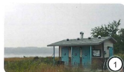
ACCESSIBLE RESTROOM FACILITIES