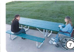
ACCESSIBLE PICNIC TABLES