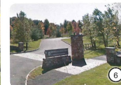
ENTRY GATEWAY FEATURE