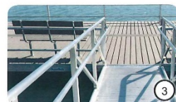
ACCESSIBLE FISHING PIER