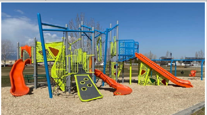
TOOELE CITY'S NEWEST PLAYGROUND WAS INSTALLED IN MARCH AT RANCHO PARK (900 W. Timpie Road)! This playground equipment replaced old playground equipment that was removed for safety purposes.

Early Head Start offers a variety of services: •Weekly 90 minute home visits •Developmental screening and assessments •Family group activities •Prenatal health education •Community resources and referrals •Health, safety, and nutrition education •And more!