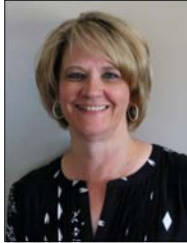
Mayor Debbie Winn

- Presented at the Tooele City Council Meeting on February 19, 2020 -