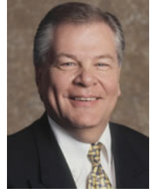
Mayor Patrick Dunlavy