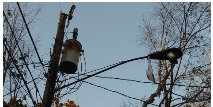
Pepco repaired this light, in the 5400 block of Trent Street, last fall.

Pepco isn't perfect (for example, lights may not be correctly repaired the first time). But if they are unaware of problems, they cannot fix them at all. If we want to make sure that our streetlights are functional, then it is up to us to let Pepco know when they are not.