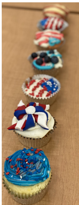
Cupcake competition entries