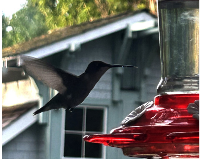
A hummingbird celebrates the Town Council's decision in our backyard.