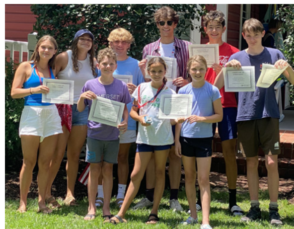
Swim team recordholders