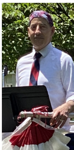
Congressman Jamie Raskin