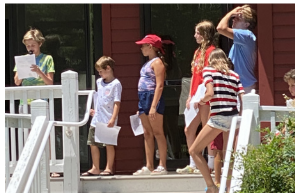
Some of the readers of the Declaration of Independence