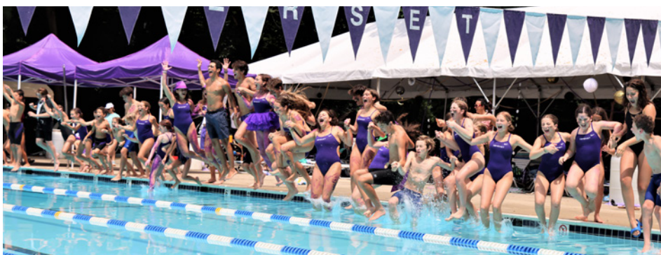
Dolphins celebrate their final home meet victory against Glenmont on July 8th with a traditional post-win jump in the pool.