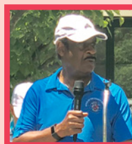
County Executive Ike Leggett