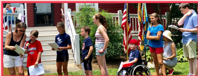
Young residents read the Declaration of Independence