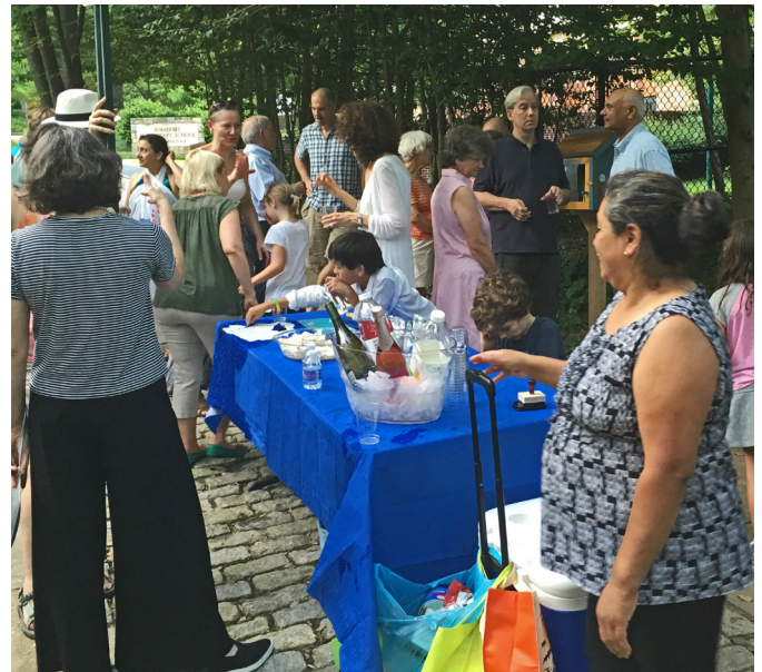
Somerset neighbors gather at Free Little Library event.