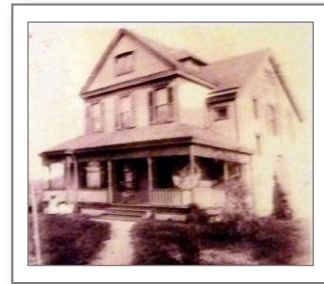
One of the earliest homes in Somerset, 4805 Dorset, 1893