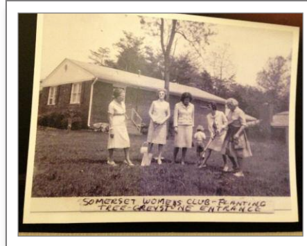
Elegant gardeners from the Somerset Women's Club plant a tree at the Greystone Street entrance, circa 1960s