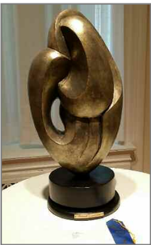
Lois Levitan’s sculpture, “Beloved”

Stay warm, and drop me a line if you have news for next month’s column.