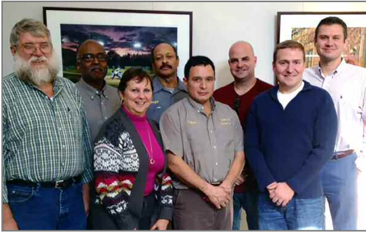
Somerset town staff at the annual staff lunch