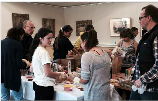
Somerset annual Community Service Day

On a recent weekend, a sizeable number of residents showed up at Town Hall for our annual Community Service Day. The primary project was to make lots of sandwiches and assemble lunch bags for the homeless men sheltered at the