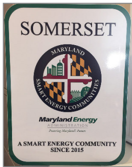
Somerset is a Smart Energy Community