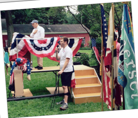
Star Spangled Banner