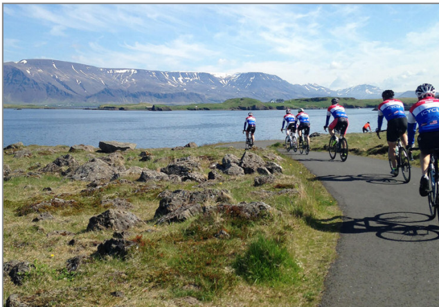
Iceland Bike Race Participants

Team Icycle's numbers: more than 43 hours of hard racing, two wrong turns after one flat tire, two crashes, a late-stage attack with a final sprint and some 250 transitions in which we sprinted back to our mucked-out horse trailer, grabbed the right bike and yelled 'GO, GO, GO' as the next one of us set out at high speed.