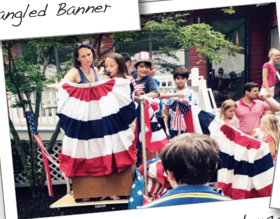
Declaration of Independence