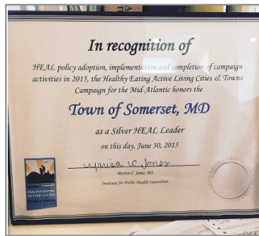
Somerset's Silver HEAL Leader certificate