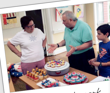
Judges at work

(Photos are in color in the online Journal)