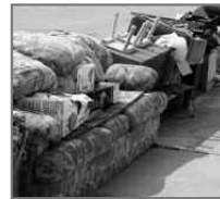
New Bulk Trash Pickup

be finishing up: one led by Washington Gas and the other by WSSC. An additional Washington Gas project was just approved at the February Council meeting, and a WSSC project on Cumberland Avenue is scheduled to be considered at the March Council meeting. Please contact the Town Hall if you would like specifics on any of these four projects.