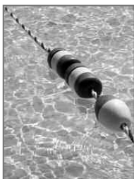
Swimming Pool Dates

The new Town website is still being finalized before it goes live. The site will likely be activated sometime in March.