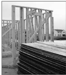
Noise Amendments Adopted

This is a reminder that the Town of Somerset must approve any trees to be removed within the Town, whether they are Town trees or privately owned. Please make sure that you contact the Town Hall to obtain a permit in advance of removing any trees from your property. Violators of this Ordinance are subject to fines in accordance with the Town Code.