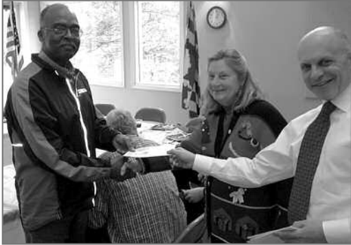
Holiday Gifts To Our Outstanding Staff

As you know, our employees work extremely hard and must contend with the high cost of living in the DC metropolitan area. They appreciate these gifts.