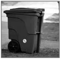
Blue Recycling Bins

that was distributed to Town residents as an insert in the January Town Journal. If you are interested in hiring someone for snow shoveling or property maintenance during the winter months, take a look at this list. Contact the Town Hall if you need a new copy.