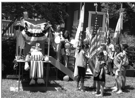
Somerset Children Reading the Declaration of Independence

The children of Somerset did a superb job this year reading the Declaration of Independence aloud at our Town festivities on the Fourth of July. Some were new and others veteran readers. All of them deserve accolades for their efforts to master the language—and spelling—of our Founders, and for their poise and good public speaking skills. This is not an easy endeavor and we should be proud of each and every one of them!