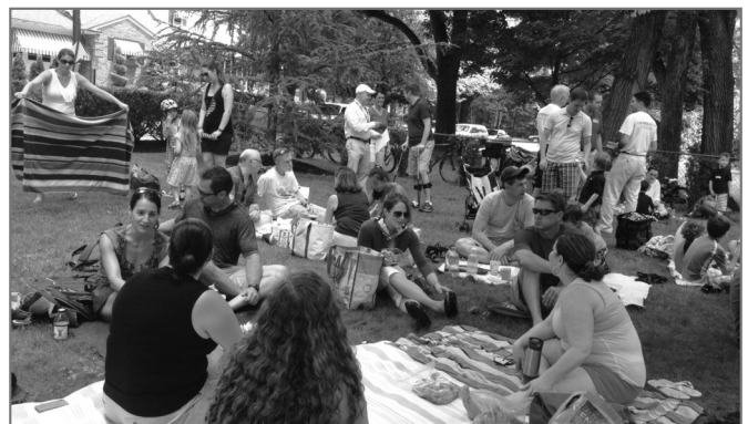
Somerset Neighbors at the Town Hall Picnic