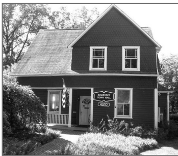
Town Hall Renovations Needed