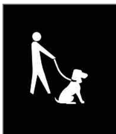
Town's Dog Regulations

Please keep two things in mind regarding the walking of dogs within the community.