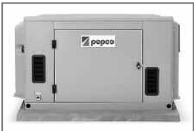
Generator Noise Regulations

Officials at Town Hall recognize all of the difficulties right now with the significant amount of construction occurring in the Town. The Town will continue to enforce its Code, monitor construction projects and ensure that construction regulations are reinforced with applicants, contractors, and sub-contractors for all projects. It is important that the Town do its best to enforce its regulations to minimize disruptions to existing property owners while welcoming those who are moving into the Town. If you are having work done on your home or are building a new home within the Town, please keep in mind the following regulations: On weekdays, work cannot start before 7:00 a.m. On Saturdays and Federal holidays, work cannot begin before 9:00 a.m. On Sunday, only interior work that cannot be heard by neighbors can be done. The Town has adopted the same work hour regulations that are administered by Montgomery County. A “ Reminders to Builders ” document can be found on the Town’s website or by contacting the Town Hall . I will be recommending to Mayor Slavin and the Town Council that they consider changing the current Federal Holiday work regulations to parallel that of Sunday interior work only.