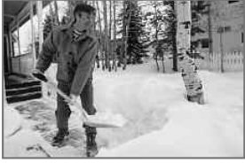
Snow Removal on Your Property

Town Code states that when 2 inches of snow or less accumulate in the front or on the side of your property, it is the responsibility of the homeowner to keep those areas clear. Greater than 2 inches is the responsibility of the Town contractor . Please also be mindful of the plows that clear our roads by doing your best to keep cars parked in driveways as opposed to on the streets. This better enables the roadways to be cleared fully. The batting cage located at the Town Hall is going to be closed this winter season from December through February . Snow last year caused some damage to the cage, so this measure is for the protection of it. The cage will open again in early March. Finally, please keep in the mind the “ odd jobs ” list that was distributed in the November Journal if you are interested in hiring someone for snow shoveling/maintenance around your property during the winter months.