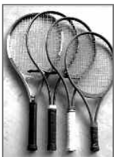
2012 Tennis Fee

The Town's Ad Hoc Tennis Committee made a recommendation to the Town Council to increase the tennis fee for Calendar Year 2012 to $20 per household. If your household uses the Town tennis courts, please contact or stop into the Town Hall to make the yearly payment and receive a tennis card . Tennis cards will be available on April 1, 2012 . Town Hall will be contacting those of you who have paid in prior years to see if your household is still using the courts.