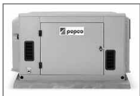
Generator Noise Regulations

Town Hall Staff recognizes all of the difficulties right now with the significant amount of construction occurring in Town. The Town will continue to enforce its Code , monitor construction projects , and ensure that construction regulations are reinforced with applicants , contractors , and subcontractors for all projects. It is important that the Town do its best to enforce regulations to minimize disruptions to existing property owners, while welcoming those who are moving into Town. With some exceptions, the Town has adopted the same work hour regulations that are administered by Montgomery County . A " Reminders to Builders " document can be found on the Town's website or by contacting the Town Hall .