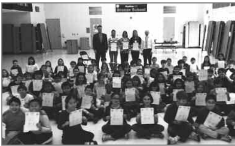
Somerset Elementary School Fourth Graders