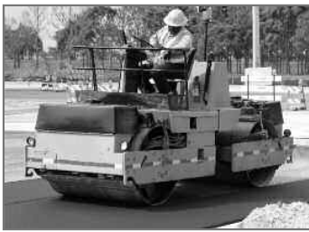
2011 Somerset Street Paving Project

The Town Council approved the paving of various Town streets at its August 1, 2011 Meeting. Francis O. Day Company, Inc. was approved as the lowest responsible bidder. Included in the paving work will be work on various sidewalks and curbs in need of maintenance. The Town discourages residents from defacing sidewalks, especially once the new repairs have been completed.