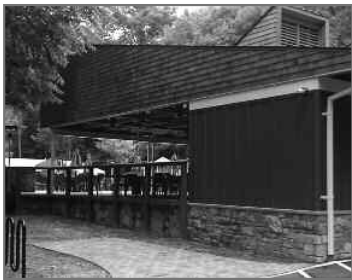
View Of Covered Pavilion area that could be closed in with Nano Walls.

It is almost hard to believe it. After years of a tremendous amount of work by a lot of people, our new pool facility is not only open and operating, but has already supported its first (though abbreviated) season for the swim team , and residents and their guests are enjoying renewed and expanded ways of using the facility. Like any new project, we are still finishing up on important details in completing the construction. Under the able direction of the Pool Committee , we are evolving new policies and processes in sharing and using the renovated facility. Residents are already stepping up to continue and expand ways of enjoying the facility now and into the future. I have great confidence that the pool facility will continue its growth as a key resource for the Town—for all of our residents—and that looking back on the effort, the cost, and the endless debates, the effort will prove to have been an excellent investment in our community.