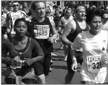
Somerset Back to School Classic 8K Race