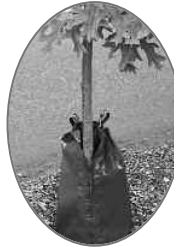
Gator Bags on Newly Planted Trees

filling them. With the dry, hot summer we have been experiencing, the water in the bags is being absorbed faster than we can refill them. Thank you for your consideration.