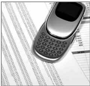
Pool House Refinancing