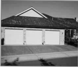
Curb Cuts Sample

Recently, the Council has been reviewing the issue of curb cuts (a break in the curb to allow