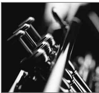
Celebrate July 4th with Somerset. Join the Somerset Community Band!