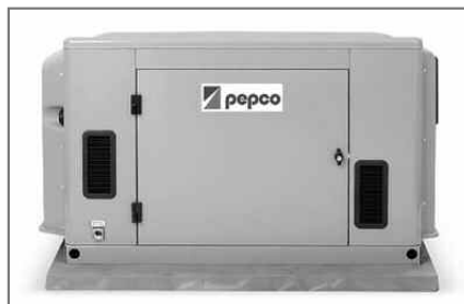
A Pepco Backup Home Generator System.

Everyone in Town knows how deeply Pepco has let us down in its repeated failures to deliver electricity on the reliable and continuous basis expected of a public utility. This has imposed serious costs and consequences for some residents, including some health risks, and has been a major inconvenience for all. One would hope that several serious state and county initiatives, and even the additional efforts of our Town's ad hoc committee on improving the reliability of Pepco services, will improve the reliability of Pepco's services soon. At the same time, a number of Town residents are taking the initiative to further protect themselves and their families by purchasing backup home generator systems that they install on their property and which will automatically engage when Pepco's system fails . This has been a common approach for the economic and political elite for many years in third world countries, and now we are seeing this practice emerging right here in Pepco's Washington, DC