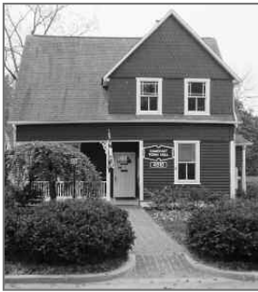
Somerset Town Hall