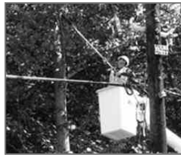
Pepco – Tree Trimming