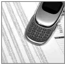
Lower Interest Rate

At a special Council Meeting held November 14 , the Town Council passed a resolution to re-fund the bond it issued in July 2010 , which will lower the interest rate. The Title to the Resolution is published in this issue of the Journal , and the full Resolution is available through the Town's office.