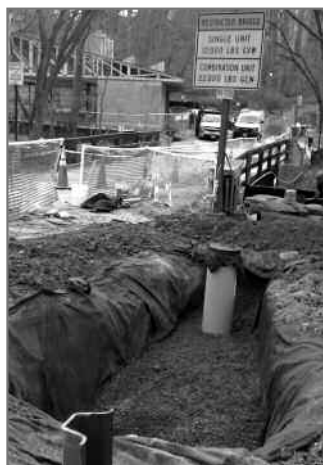
Construction of One of 3 Bio-Retention Facilities to Manage Storm Water Runoff.