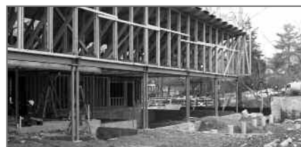
Inward-look View of New Covered Pavilion Area.

Please Note: Due to inclement weather this winter and spring, there is a possibility our Town Swimming Pool will not open by Memorial Day Weekend. Council members are meeting with the contractor and our consultant at least twice a month to check progress. Because Memorial Day is rapidly approaching, we will keep residents updated through email blasts from the Town Hall.