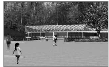
Monday, July 20 – Pool Facility Renovation