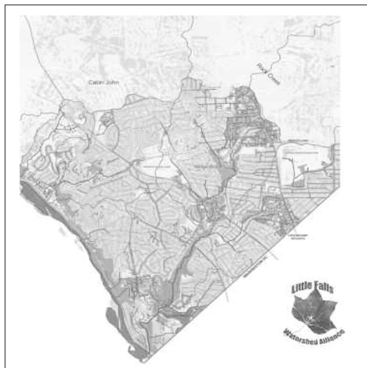
Little Falls Watershed Montgomery County Portion

Somerset's Environment Committee will be providing more information in upcoming months about the storm water program and more steps we can take to reduce our impact on the Creek, the Potomac, and the Bay. Stay tuned!