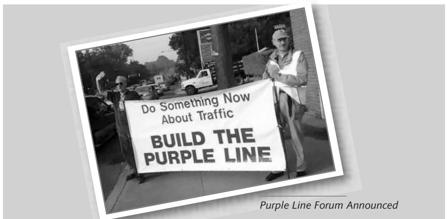
Purple Line Forum Announced

Please help us publicize this important event.