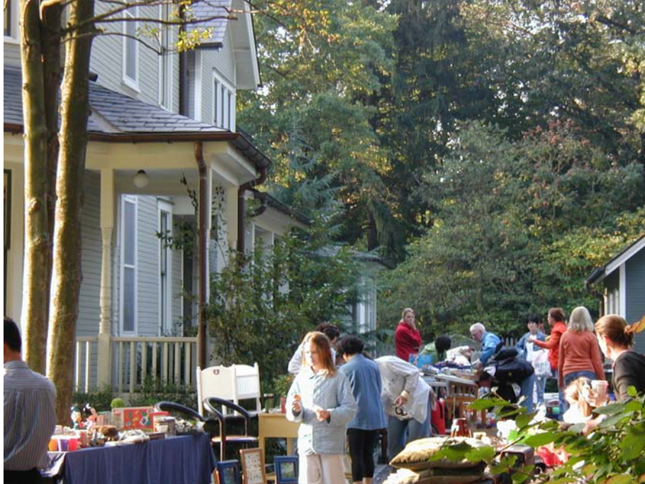
Figure 1: Somerset residents look for treasure at the yard sale.