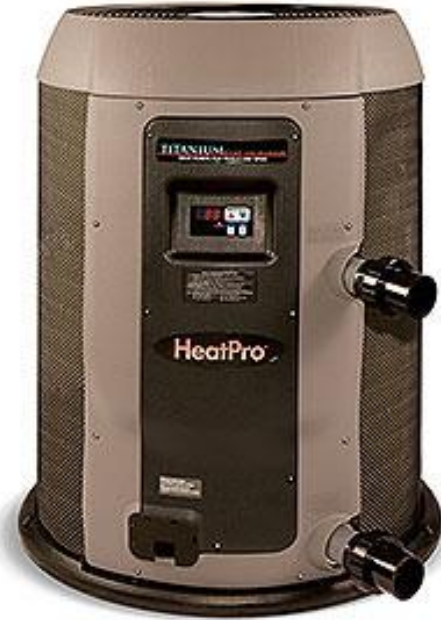
heat pump water heater (for a pool)