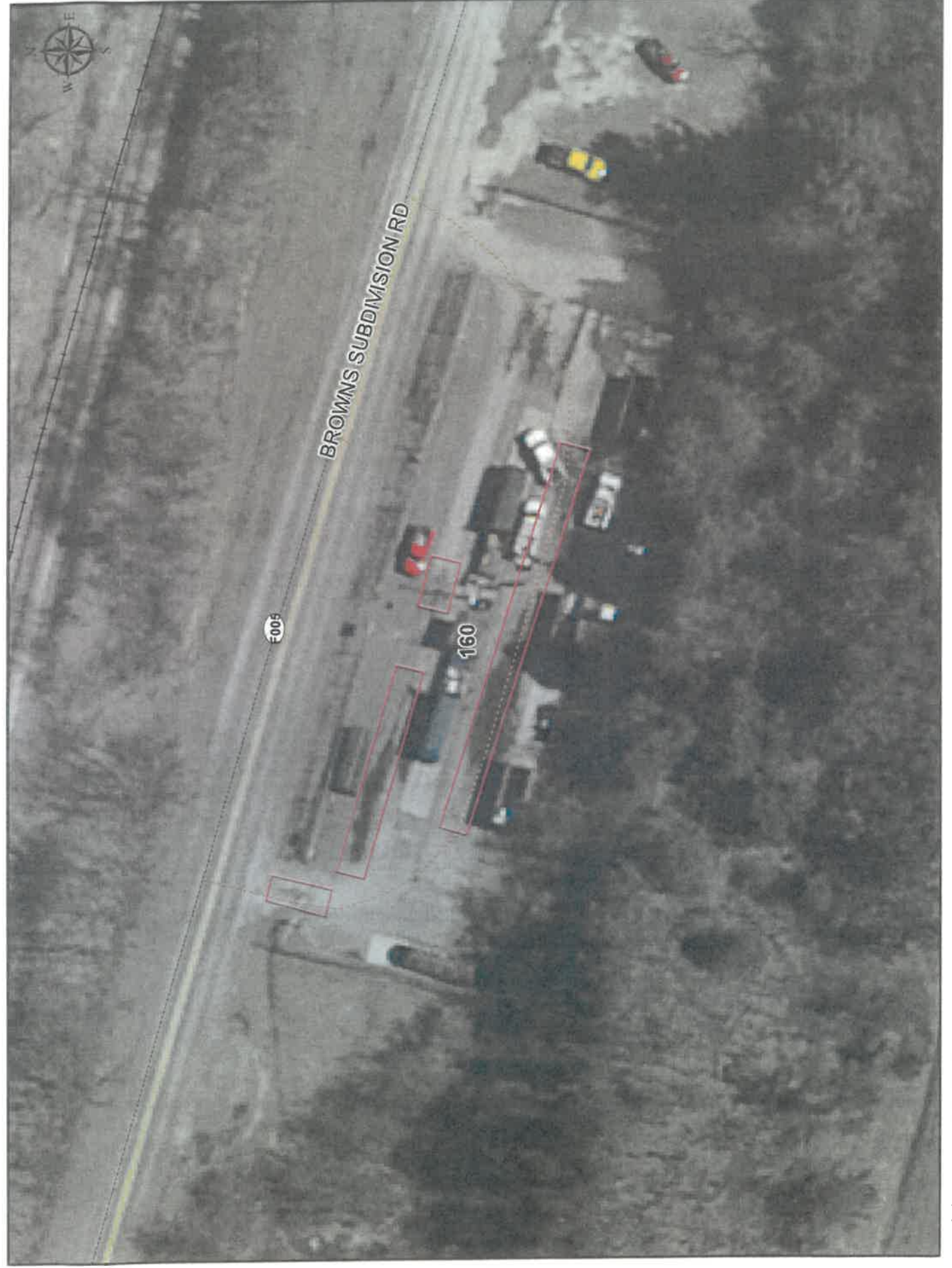
Aerial Imagery ©2002 Commonwealth of Virginia