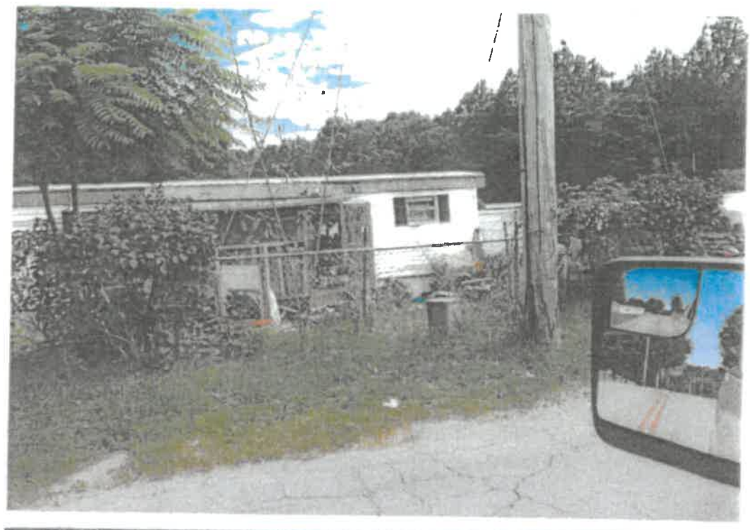
John Overbey – 409 Flat Ridge Road Nuisance Complaint – Second Notice