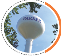
WATER DISTRIBUTION & TREATMENT