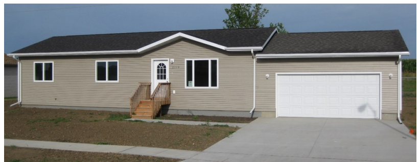
Shown above is a recently sold Governor's House located in the Grasslands Addition.