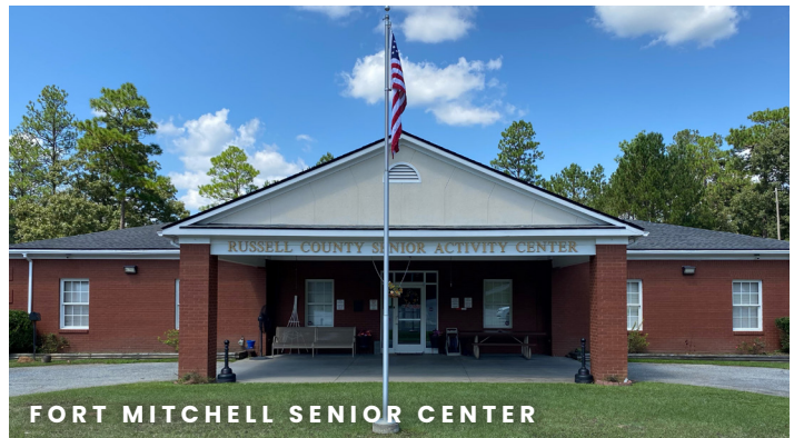
FORT MITCHELL SENIOR CENTER