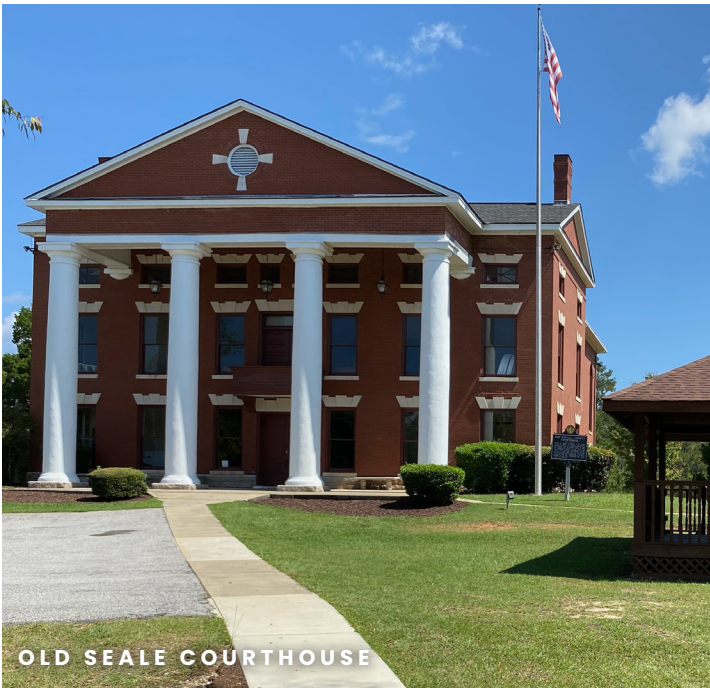
OLD SEALE COURTHOUSE