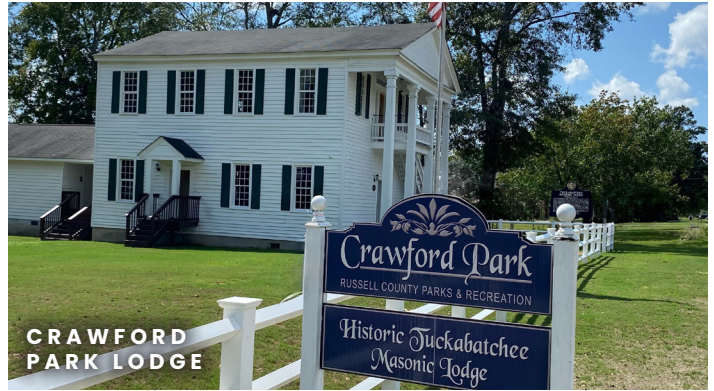
CRAWFORD PARK LODGE