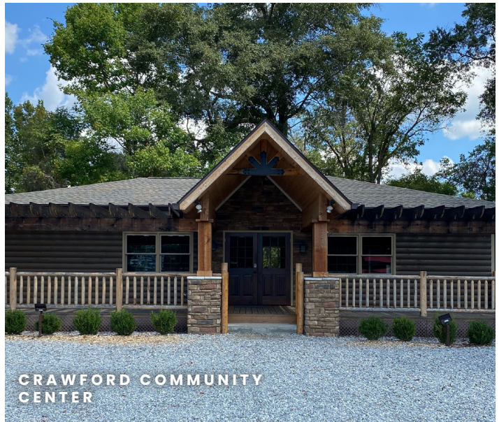
CRAWFORD COMMUNITY CENTER