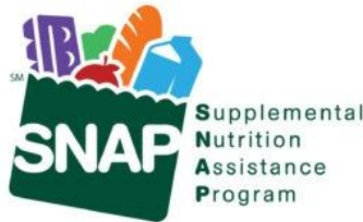
SNAP 1/3 to 2/3 of a person's food supply