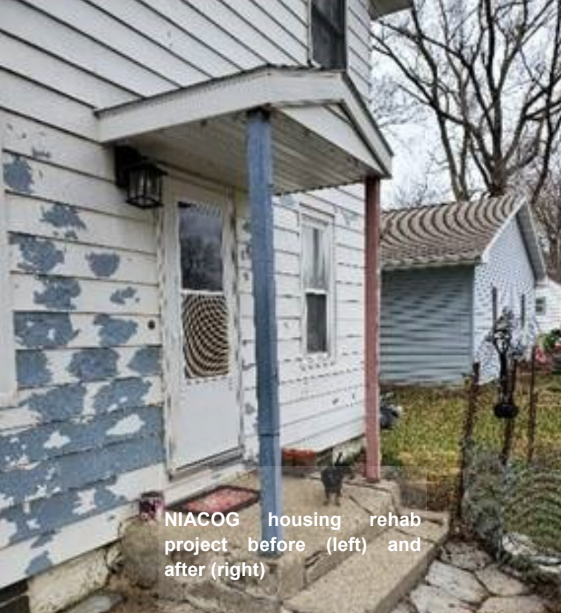
NIACOG housing rehab project before (left) and after (right)