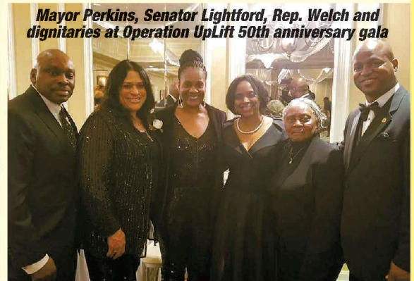
Mayor Perkins, Senator Lightford, Rep. Welch and dignitaries at Operation UpLift 50th anniversary gala