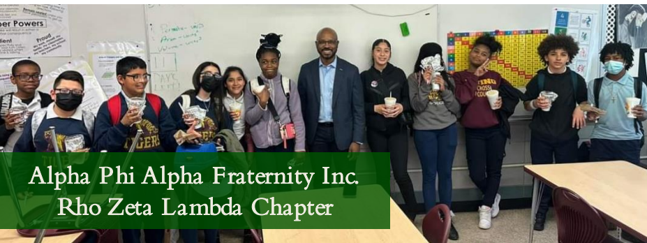
Alpha Phi Alpha Fraternity Inc. Rho Zeta Lambda Chapter