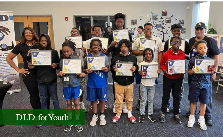
DLD for Youth