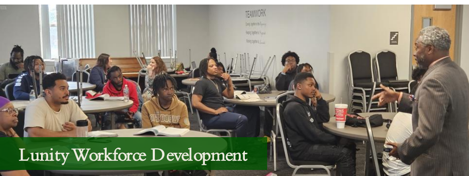
Lunity Workforce Development