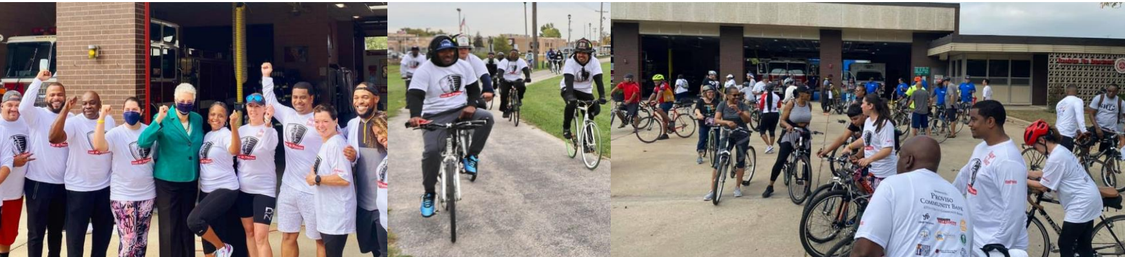
Tour De Proviso