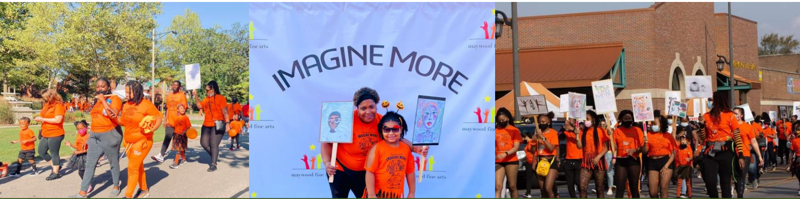
Maywood Fine Arts March for Equity in the Arts