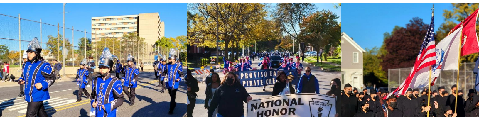
Proviso East Homecoming Parade