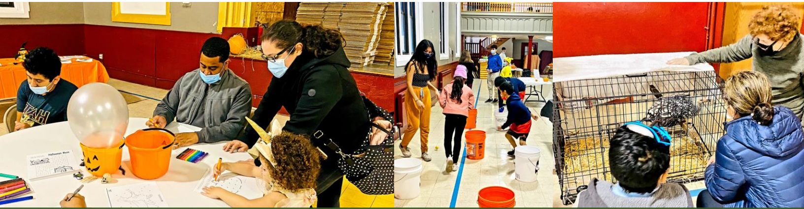
Quinn Center Fall Festival