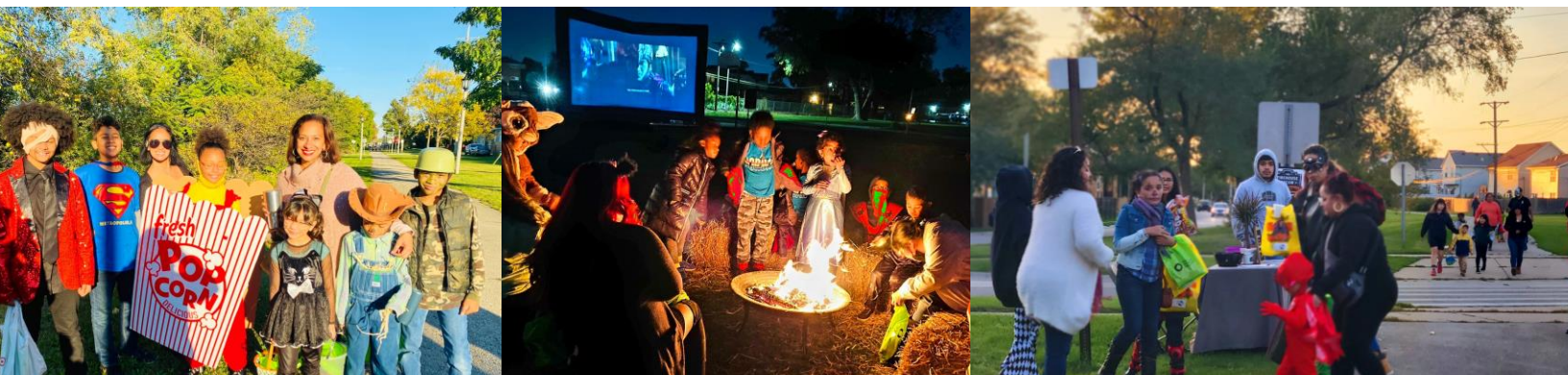
Maywood Park District Prairie Path Trick or Treat Trail with Movie at Winfield Scott