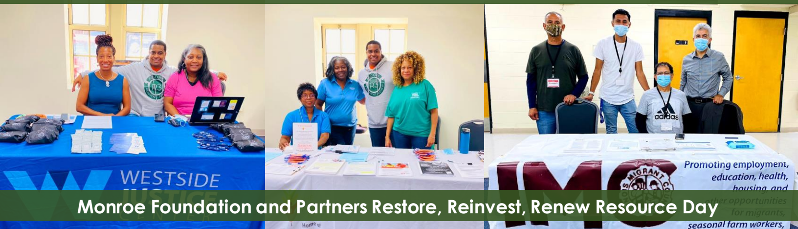
Monroe Foundation and Partners Restore, Reinvest, Renew Resource Day