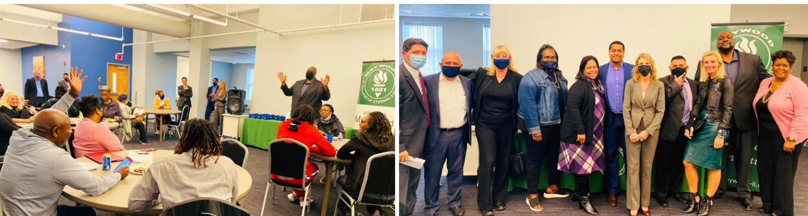
Maywood Business Community Lunch & Learn