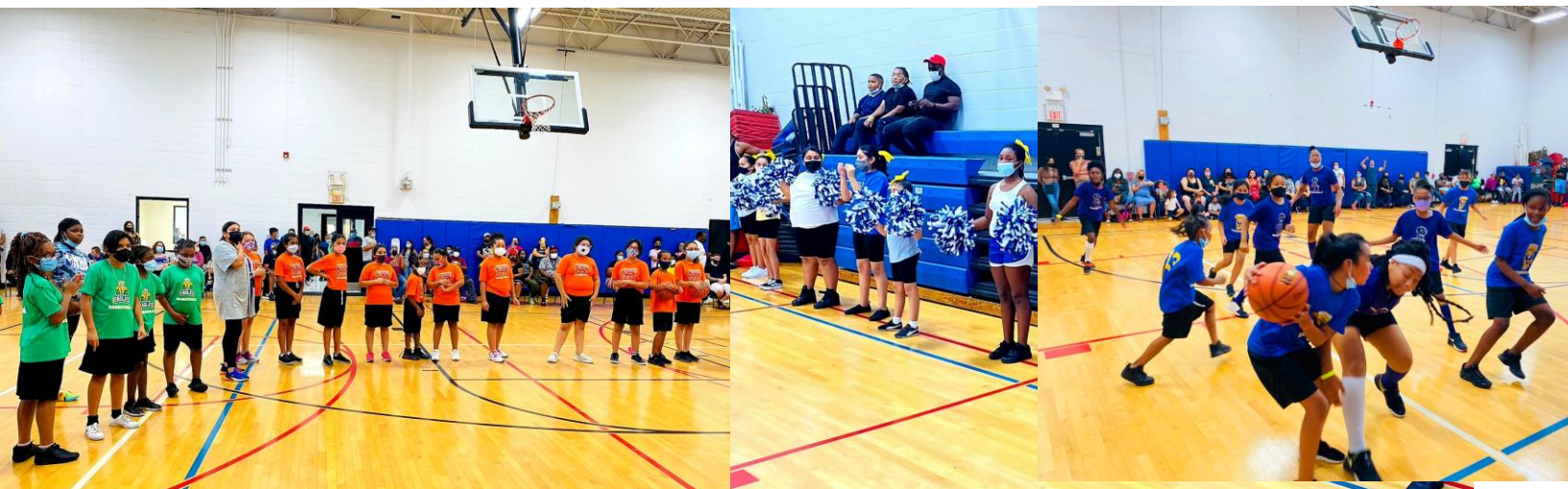
School District 89 Girls Basketball