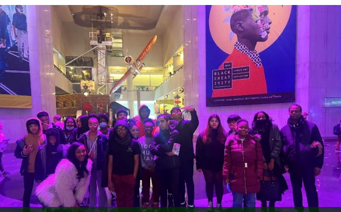
Science & Industry Museum Field Trip