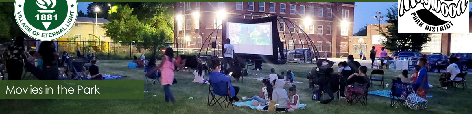
Movies in the Park