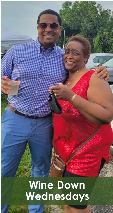
Wine Down Wednesdays