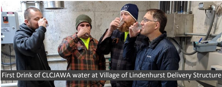
First Drink of CLCJAWA water at Village of Lindenhurst Delivery Structure

To ensure tap water safety, the U.S. Environmental Protection Agency (USEPA) prescribes limits on the amount of certain contaminants in our drinking water. Water quality may be judged by comparing our water to USEPA benchmarks for water quality. One such benchmark is the Maximum Contaminant Level Goal (MCLG). The MCLG is the level of a contaminant in drinking water below which there is no known or expected risk to health. This goal allows for a margin of safety. Another benchmark is the Maximum Contaminant Level (MCL). An MCL is the highest level of a contaminant that is allowed in drinking water. An MCL is set as close to an MCLG as feasible using the best available treatment technology.