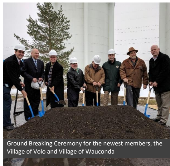
Ground Breaking Ceremony for the newest members, the Village of Volo and Village of Wauconda

CLCJAWA received the Excellence in Water Treatment award for the last 14 years. CLCJAWA was the third facility in the nation to achieve this distinction presented by the Partnership for Safe Water. This voluntary water quality program, sponsored in part by the United States Environmental Protection Agency, holds its awardees to higher standards than required by current Federal and State drinking water regulations.