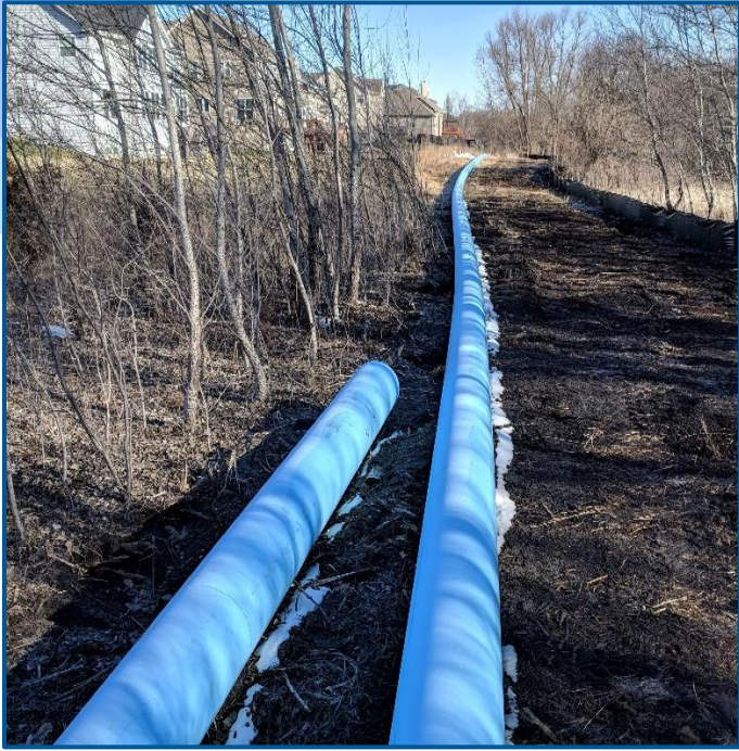
Figure 1: New drinking water pipeline prior to installation that now delivers water to Lake Villa and Fox Lake Hills residents.

CLCJAWA utilizes over 50 miles of pre-stressed concrete, ductile iron and PVC water main to deliver water to your community. Lindenhurst Public Works Department, in turn, maintains its own water distribution system that delivers the water to homes, schools and businesses in the community.