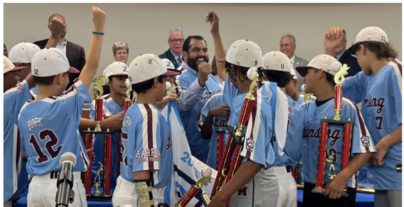
The team celebrates their achievement with trophies presented to them at the Aug. 19 Village Board meeting.