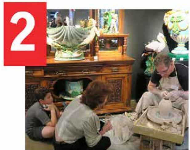
2 Long-term residential and museum employment and visitor expenditure