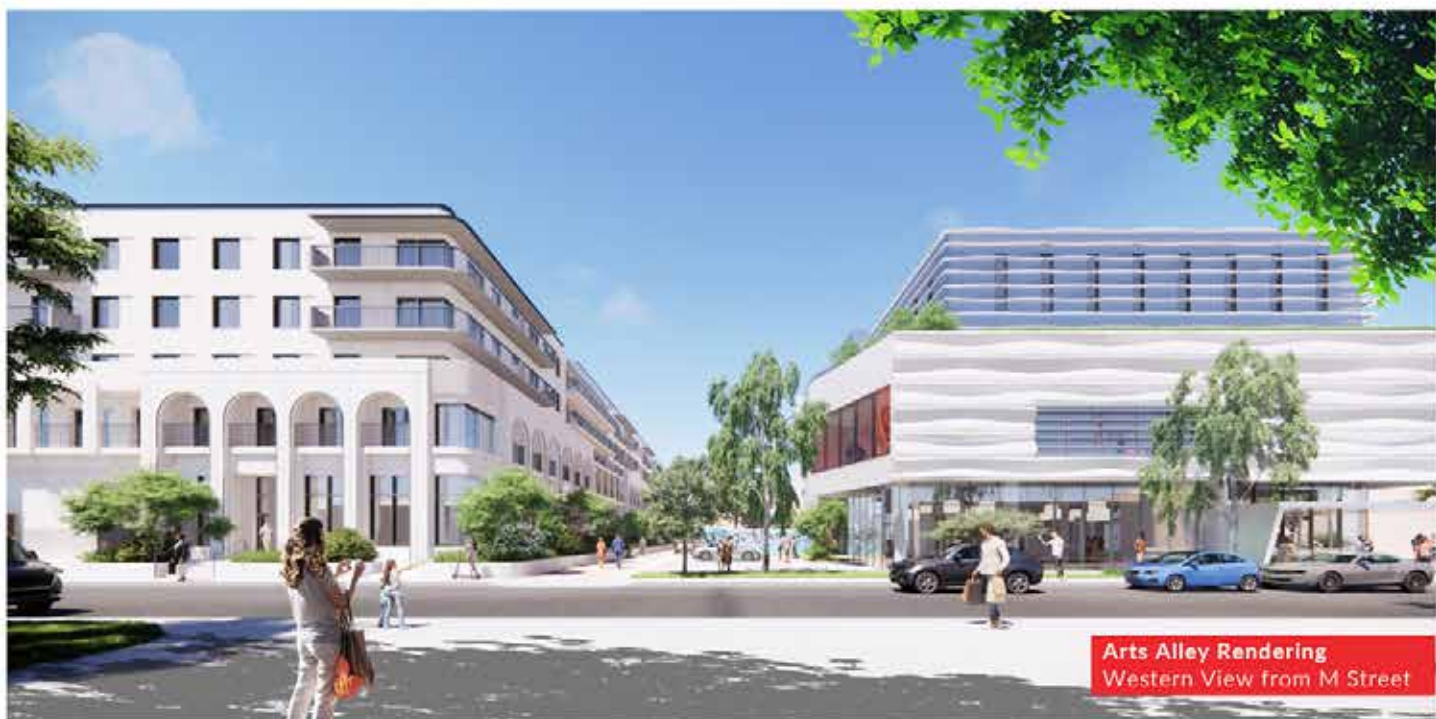
Arts Alley Rendering Western View from M Street