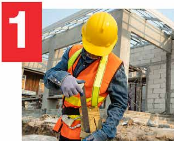
1 Short-term construction employment and expenditure

There are four key areas in which the proposed WMODA Mixed-Use Cultural Arts Campus will provide positive economic impacts: