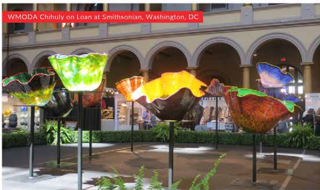
WMODA Chihuly on Loan at Smithsonian, Washington, DC