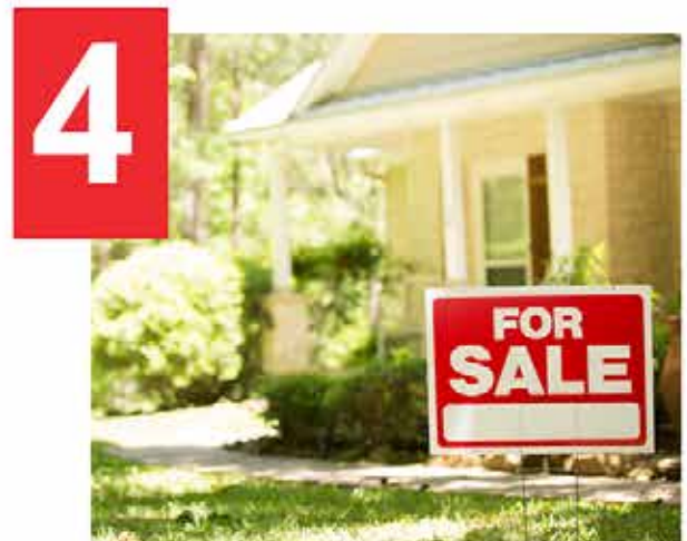
4 Positive Impacts on Surrounding Properties