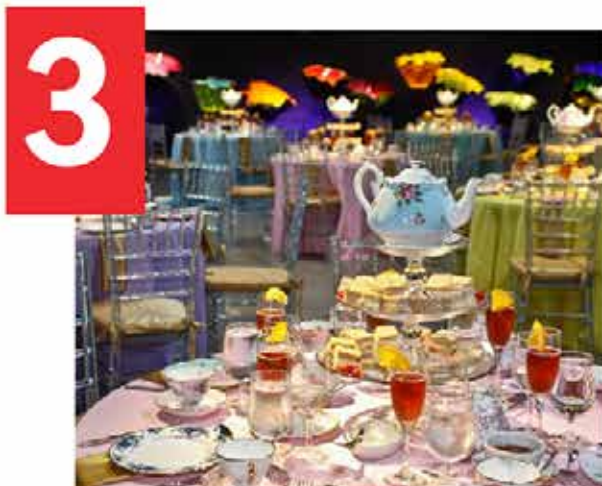
3 Incremental Ad Valorem Tax Revenue