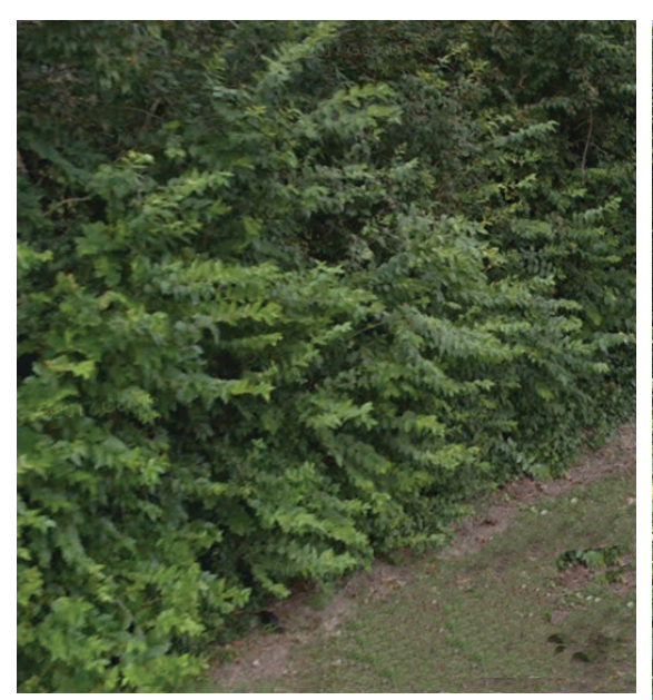
Invasive honeysuckle before removal.

The call goes through your home cable company's system – call your provider to see if you can enable it!