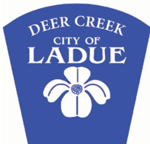
New City of Ladue Creek Signs