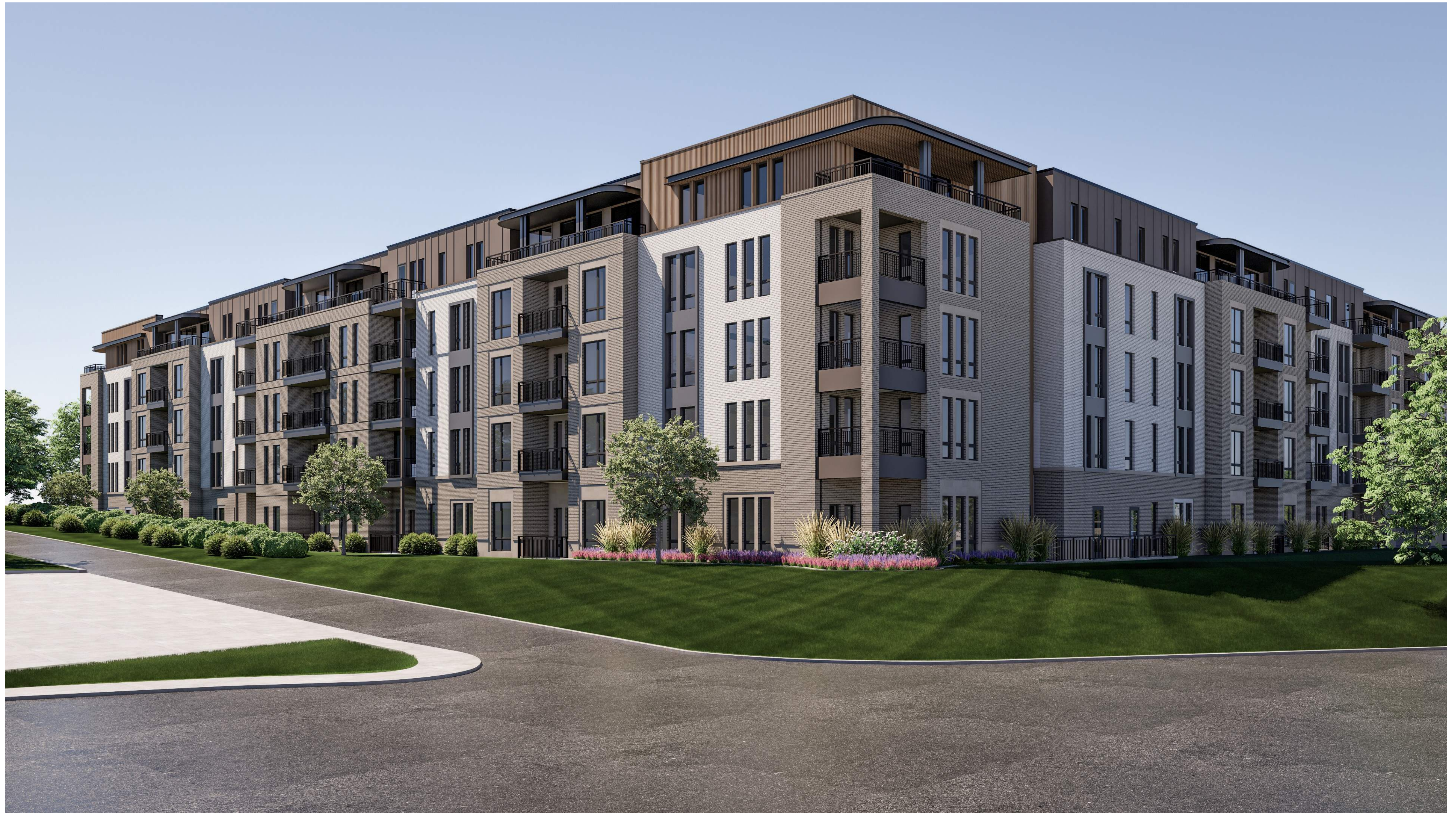
SOUTHEAST CORNER - McKNIGHT ROAD