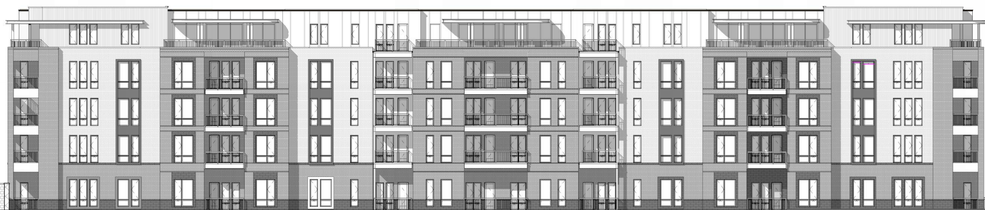
2 ELEVATION - NORTH RDD - 02 1/16" = 1'-0"