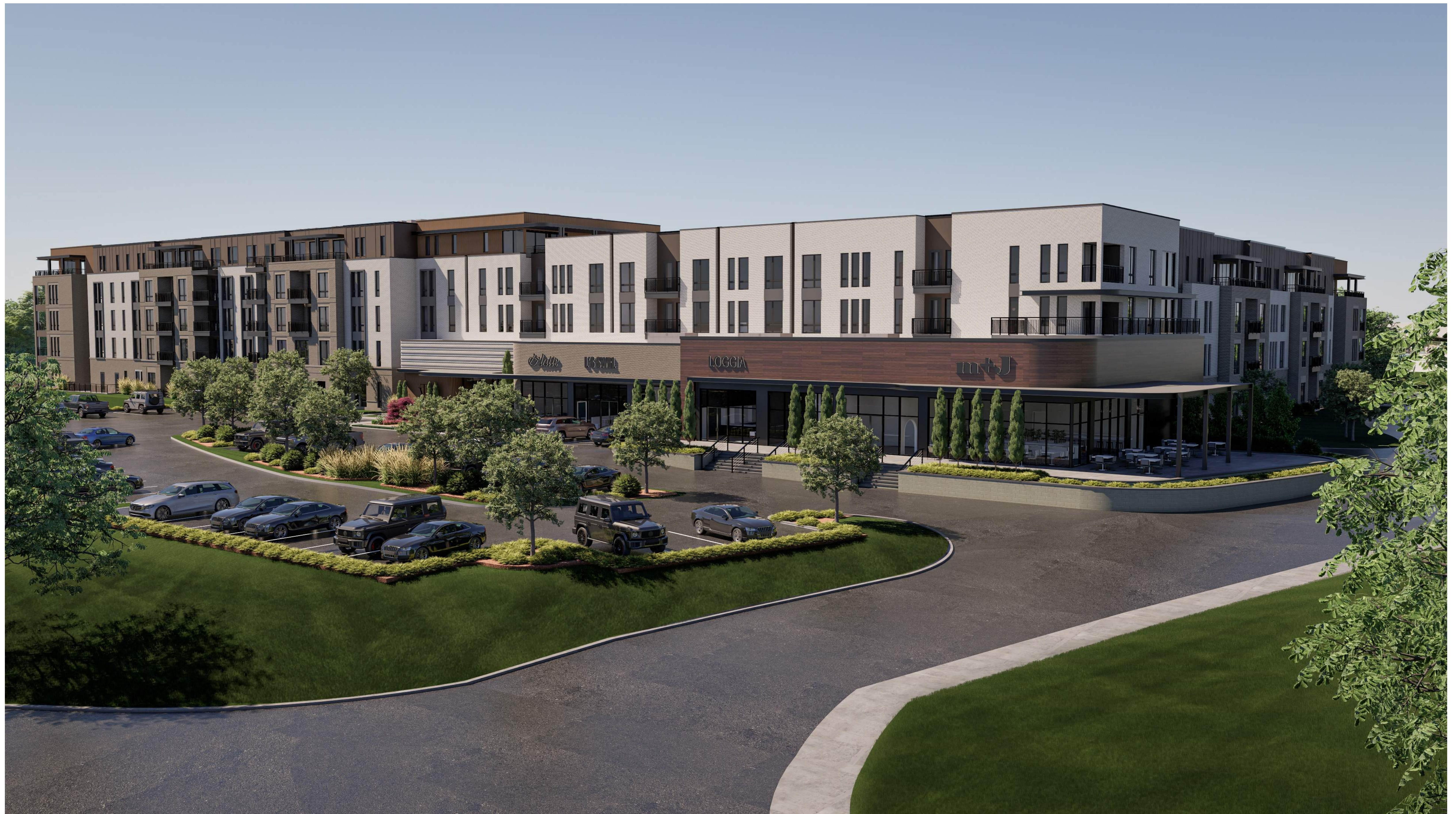
NORTHEAST CORNER - MCKNIGHT ROAD