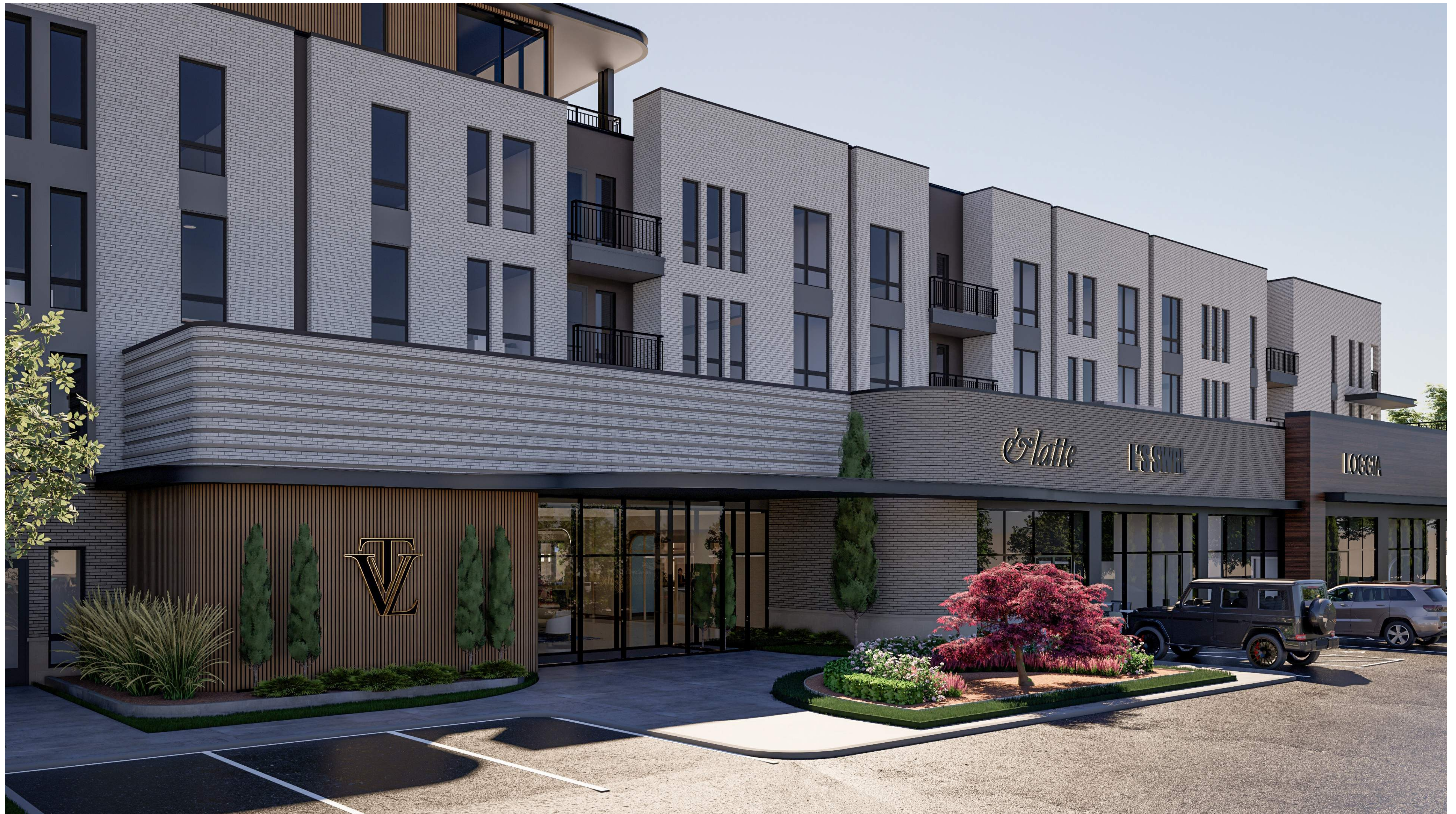
RESIDENTIAL ENTRY & RETAIL