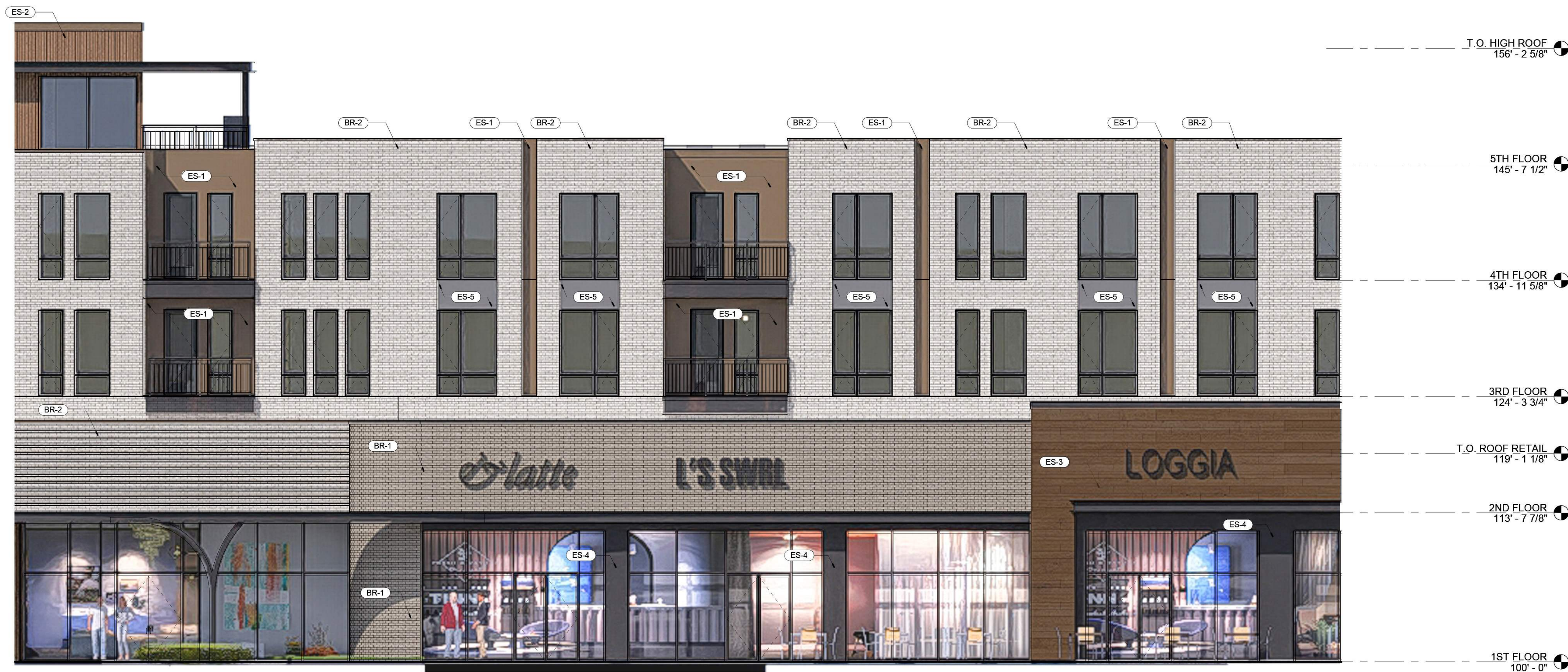
11 ELEVATION - RETAIL A-202 3/16" = 1'-0"