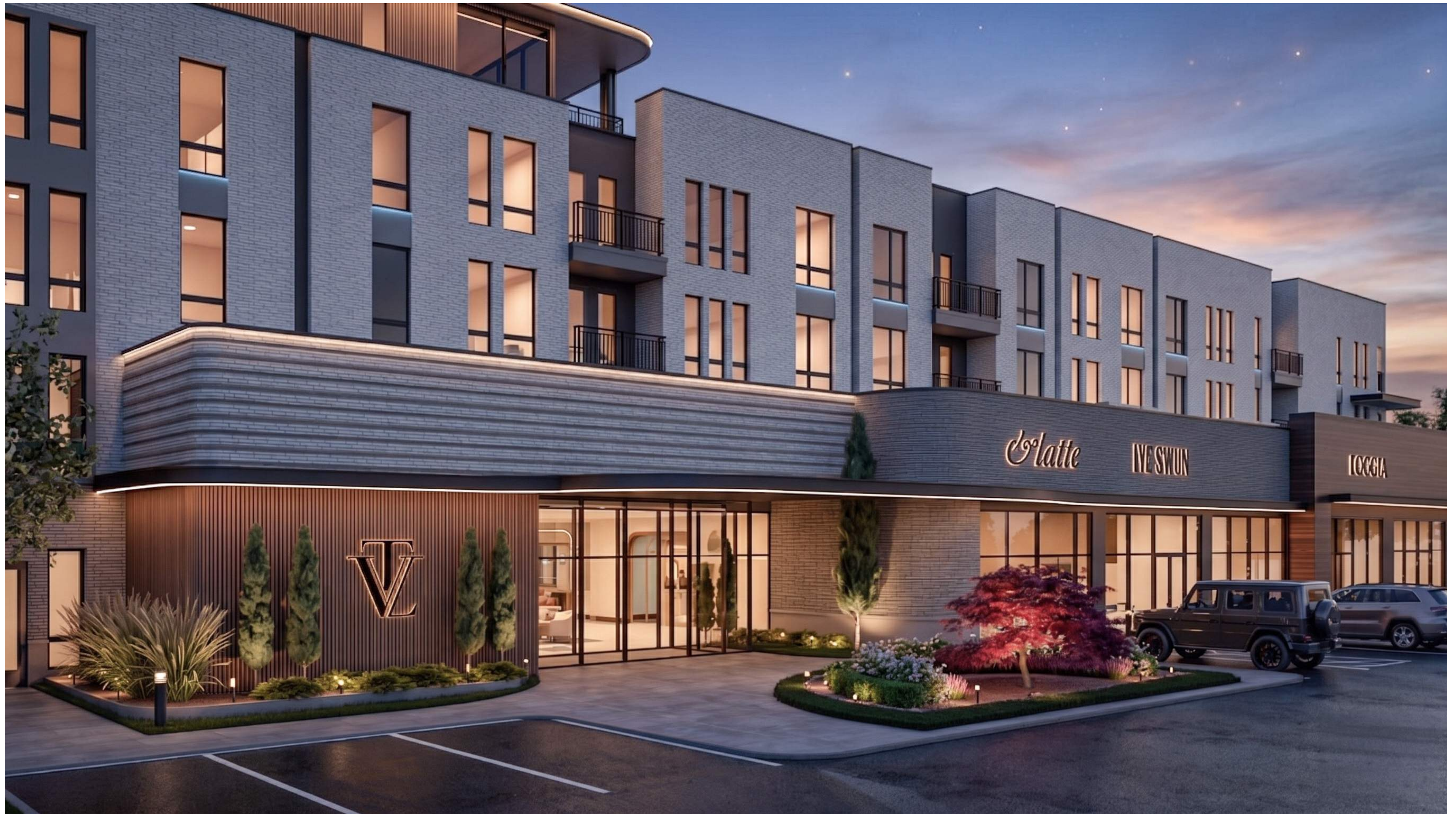
RESIDENTIAL ENTRY & RETAIL DUSK