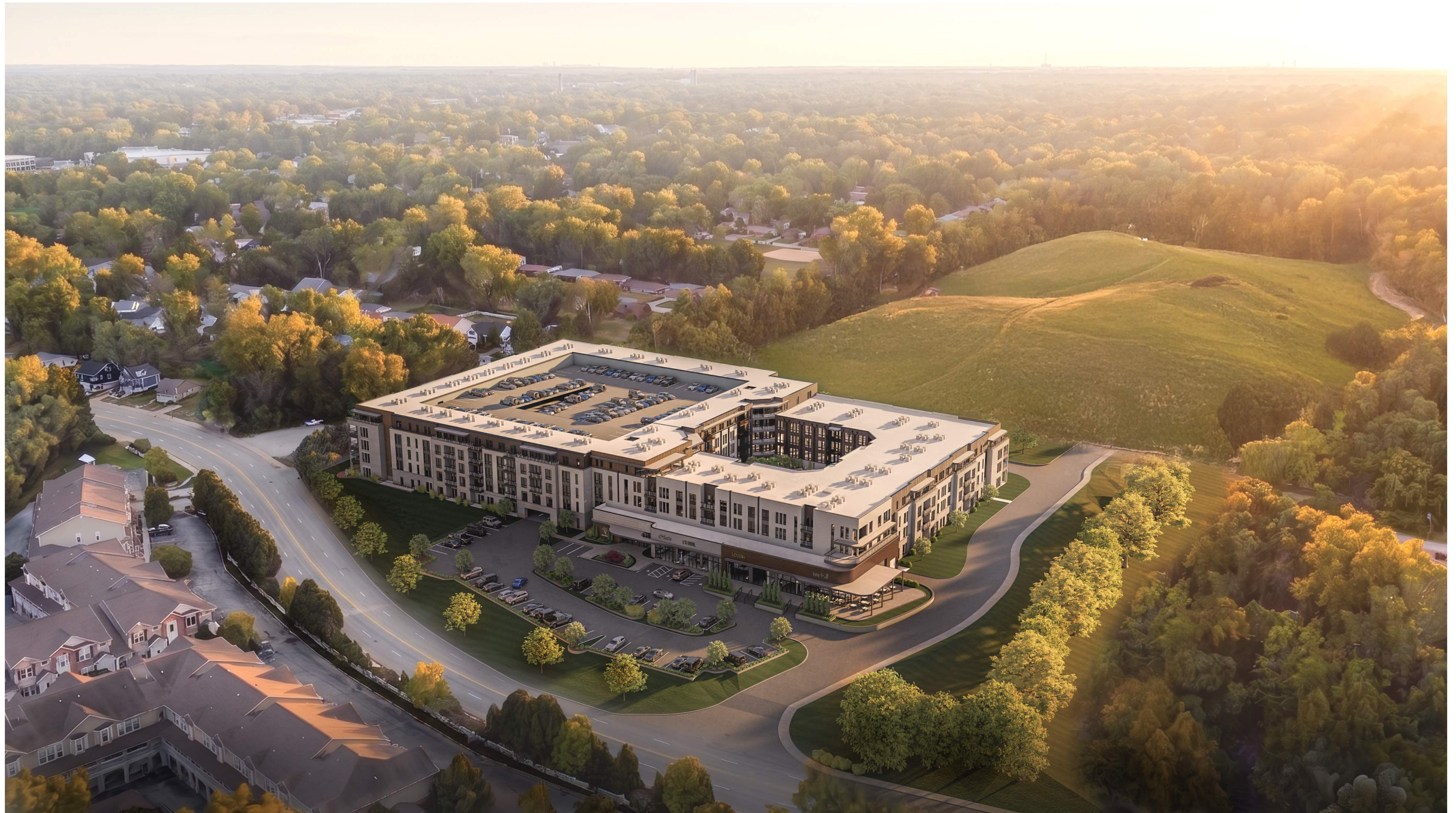
NORTHEAST - AERIAL VIEW