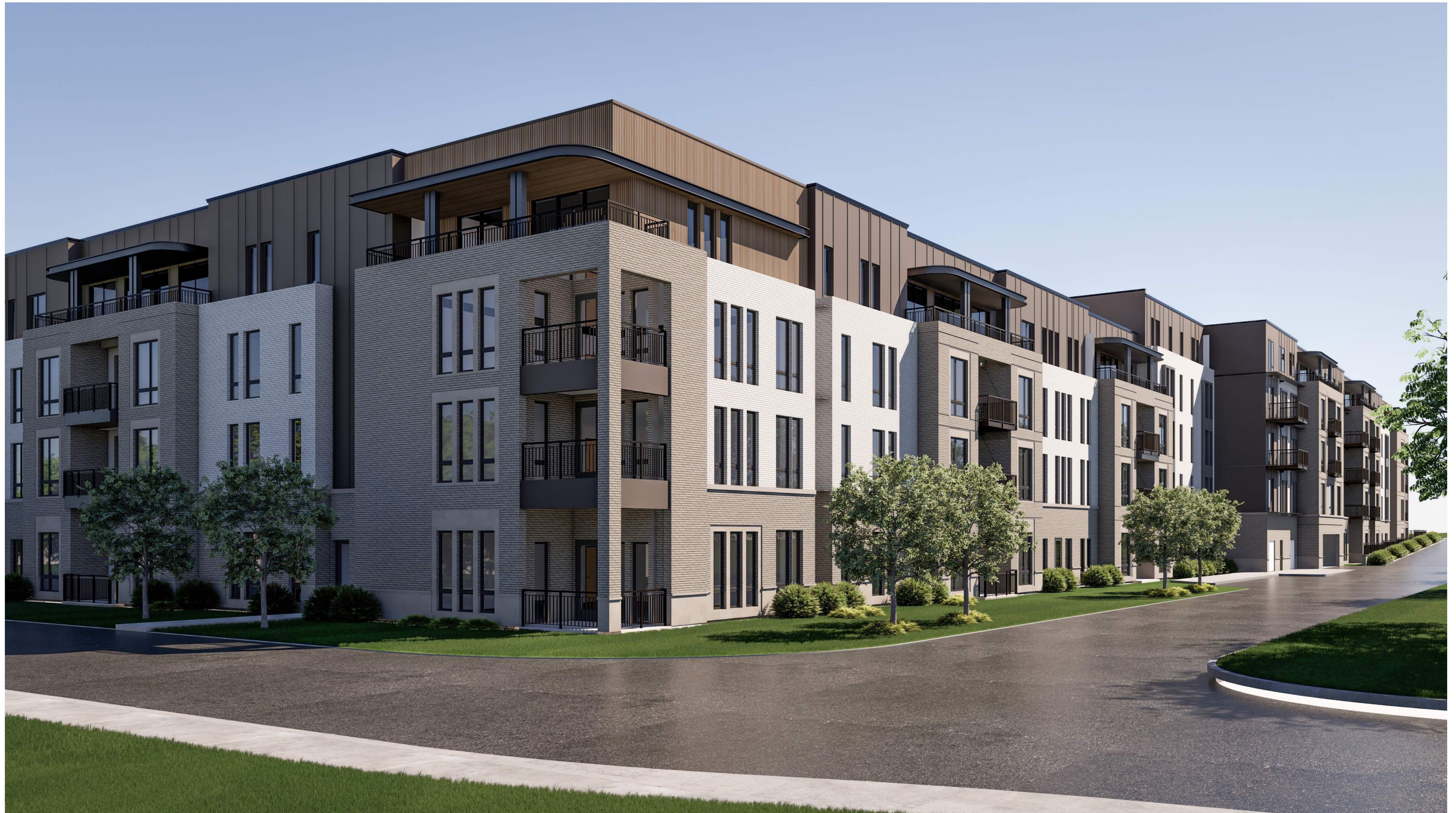
NORTHWEST CORNER - ROCK HILL ROAD