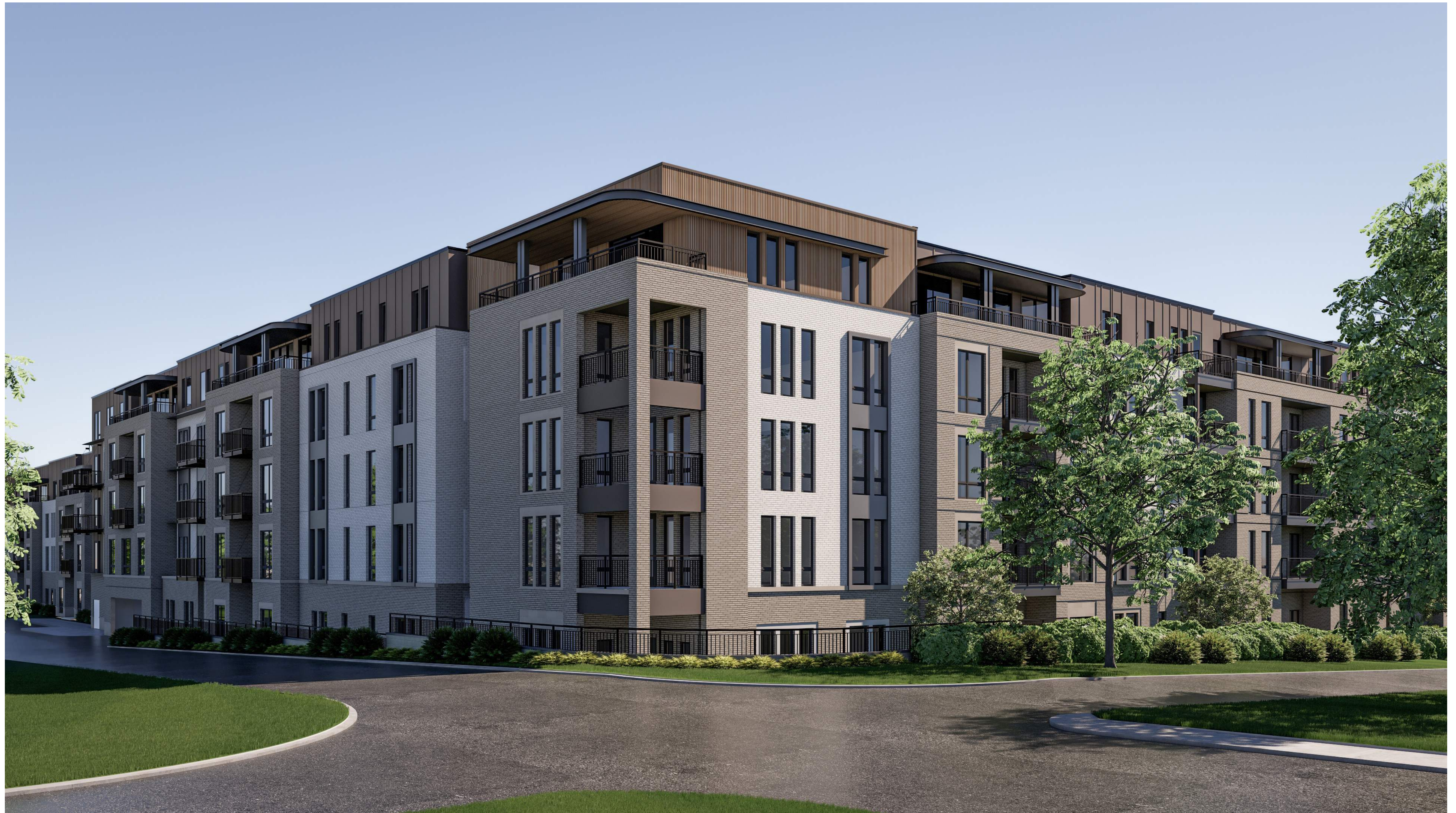
SOUTHWEST CORNER - OLD WARSON ROAD