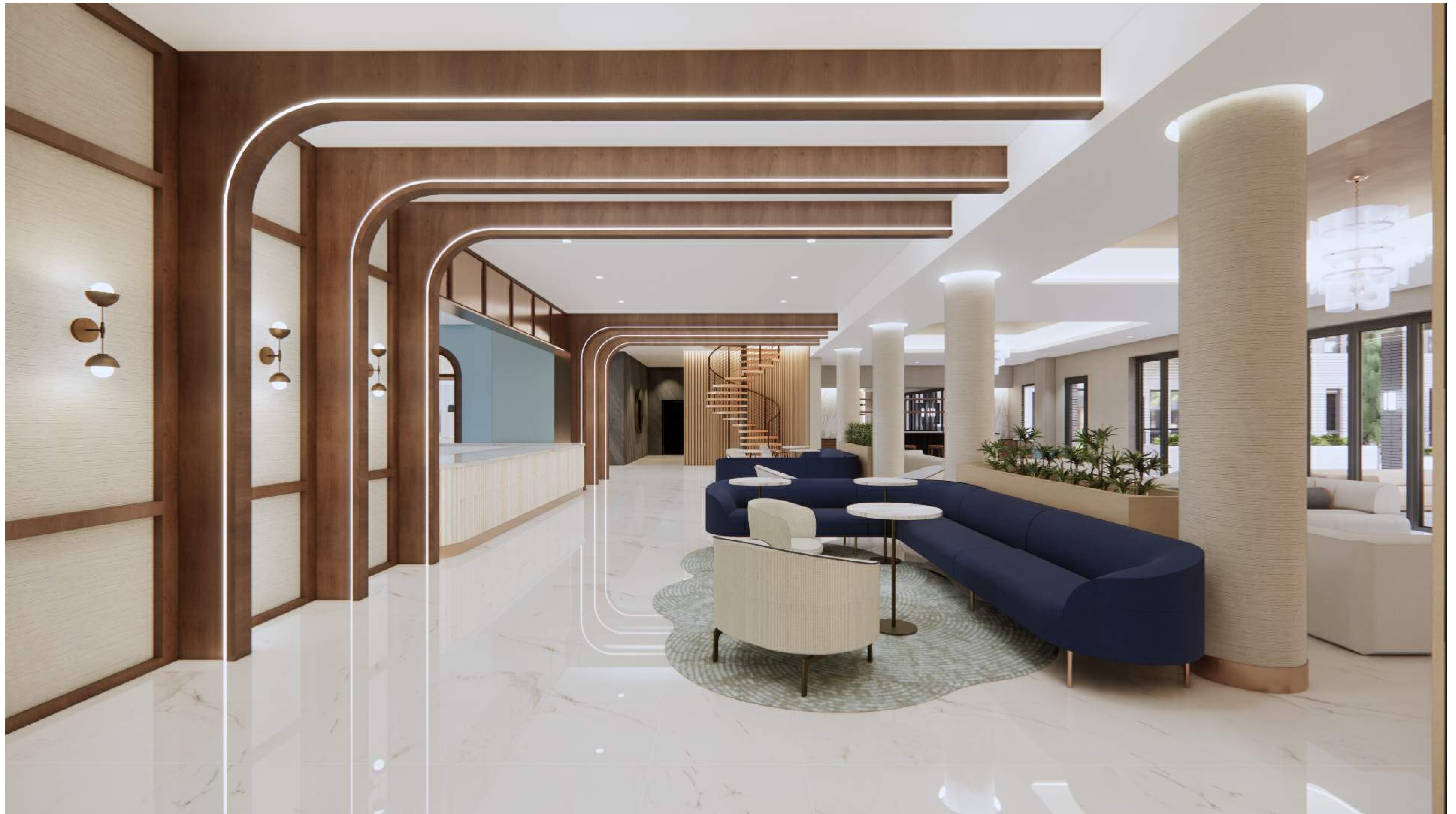
RESIDENTIAL CLUB ROOM