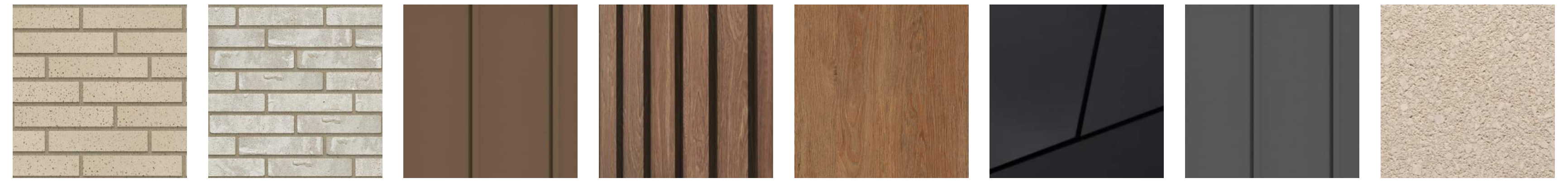
BR-1 BR-2 ES-1 ES-2 ES-3 ES-4 ES-5 ST-1